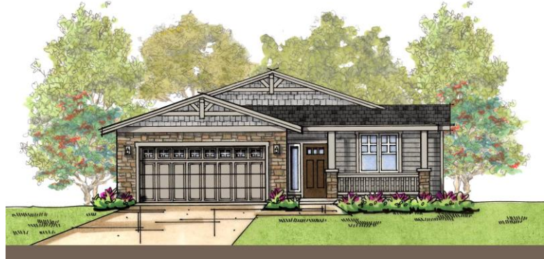
Coastal 2 (optional)