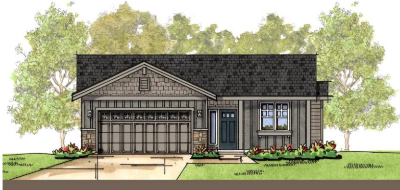
Coastal 1 (included)

3,064 sqft • 4 beds, 3 baths • 2 car garage • study • family room • covered patio