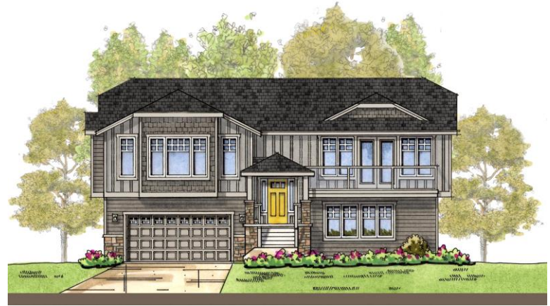
Coastal 2 (optional)