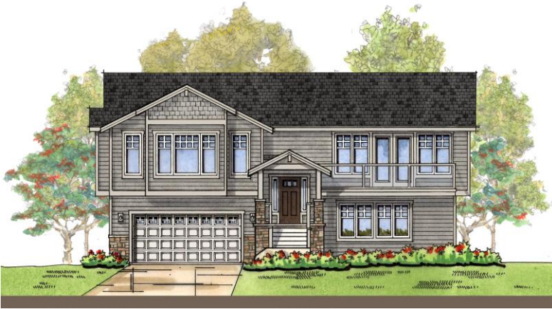
Coastal 1 (included)

2,396 sqft • 4 beds, 3 baths • 4 car garage • media room • walk-in closet • covered deck