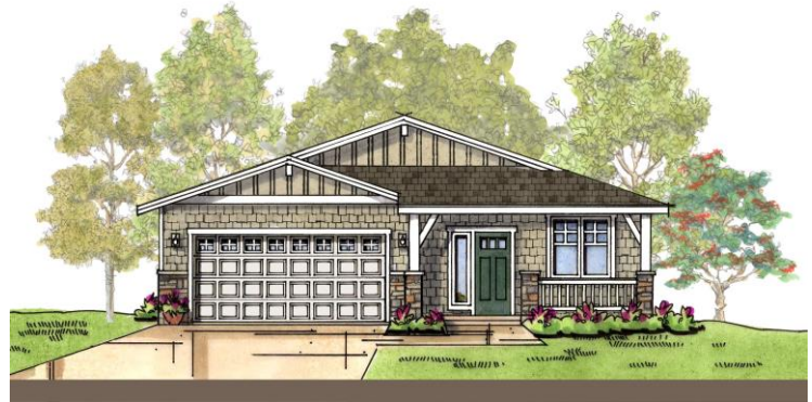
Coastal 2 (optional)