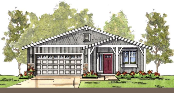
Coastal 1 (included)

2,616 sqft • 3 beds, 2.5 baths • 2 or 3 car garage • family room • media room • study