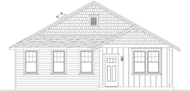
Front - Craftsman 1 (included)

1,641 sqft • 2 beds + study, 2 baths • 2-car rear garage 3rd bedroom option