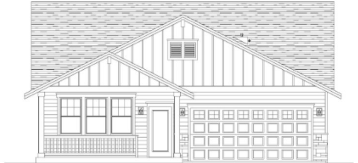
Back - Craftsman 3