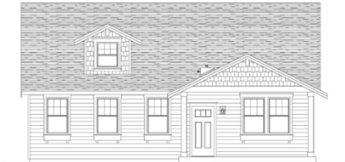
Front - Craftsman 4 (optional)