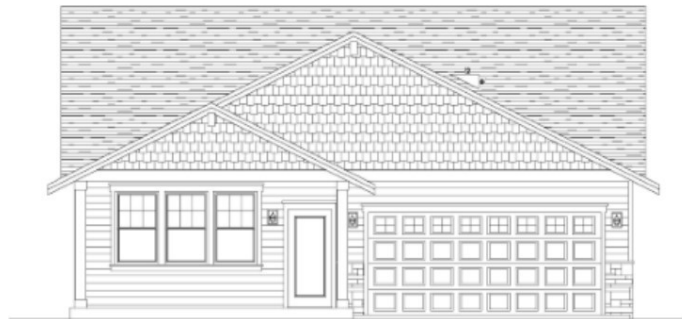
Back - Craftsman 4

Floor plan, elevation & specifications shown are for illustration purposes only. Colors and sizes are approximate. Builder reserves the right to revise floor plans and specifications as necessary.