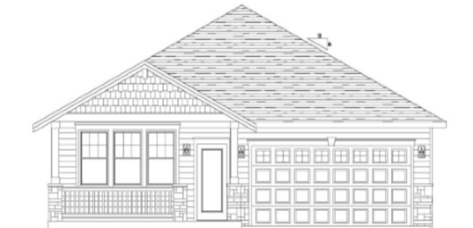
Back - Craftsman 2

Floor plan, elevation & specifications shown are for illustration purposes only. Colors and sizes are approximate. Builder reserves the right to revise floor plans and specifications as necessary.