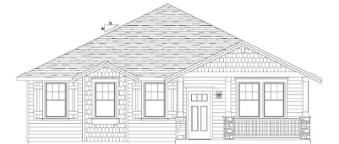
Front - Craftsman 2 (optional)