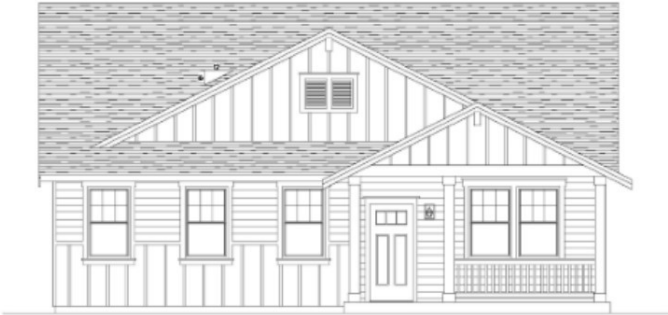
Front - Craftsman 3 (optional)

1,641 sqft • 2 beds + study, 2 baths • 2-car rear garage 3rd bedroom option