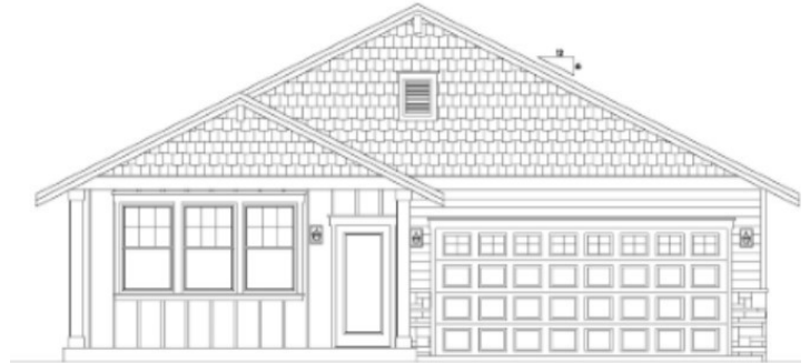
Back - Craftsman 1