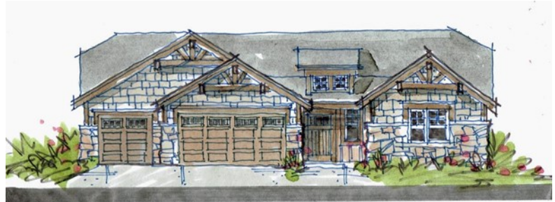
Alpine 2 (optional)