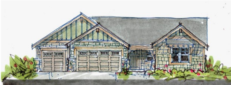
Alpine 1 (included)

2,169 sqft • 3 beds, 2 baths • Optional 2 nd master suite • 3-car garage