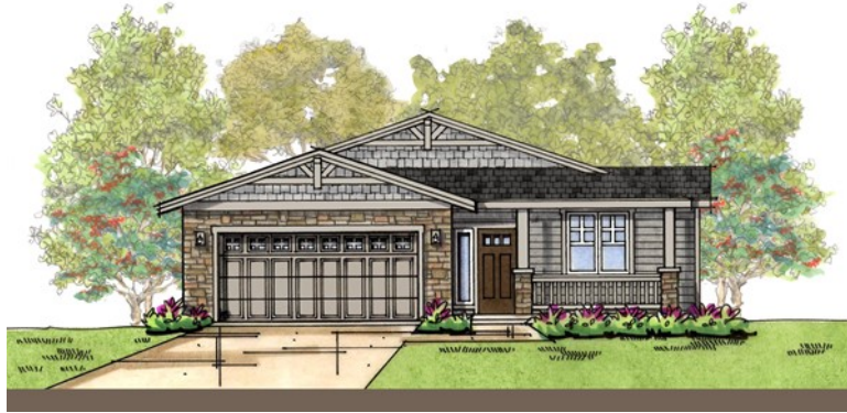
Coastal 2 (included)

3,064 sqft • 4 beds, 3 baths • 2 car garage • study • family room • covered patio