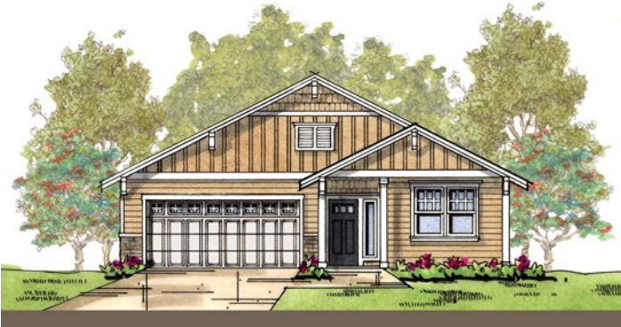
Craftsman 1 (included)

1,846 sqft • 3 beds, 2 baths • 2-car garage • single level home