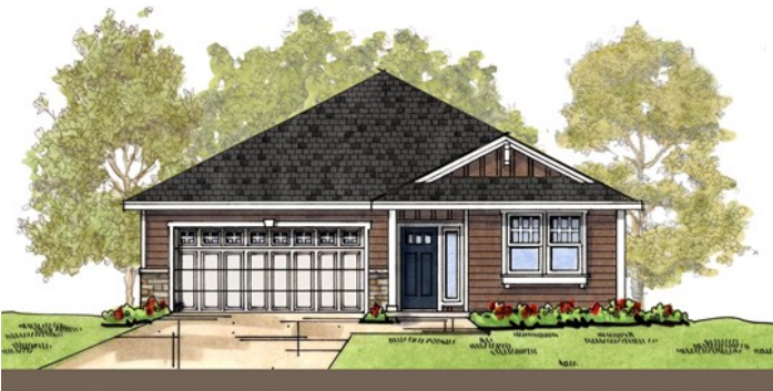
Craftsman 3 (optional)