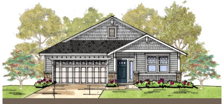
Craftsman 2 (optional)