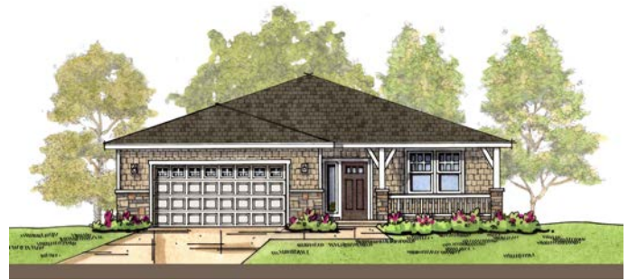
Coastal 3 (optional)