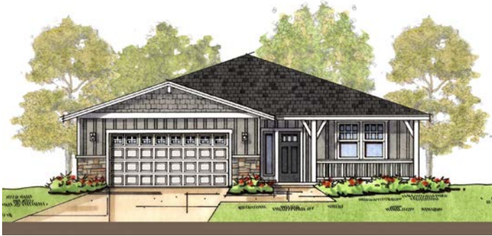
Coastal 1 (included)

3,291 sqft • 5 beds, 3 baths • 2 or 3 car garage • media room • family room • patio