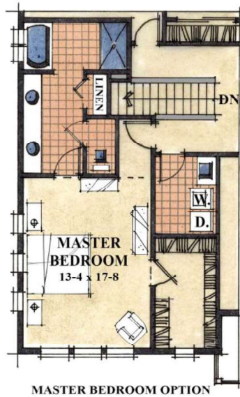
MASTER BEDROOM OPTION