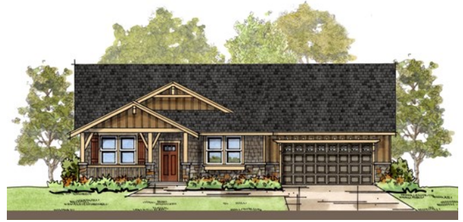
Alpine 2 (optional)