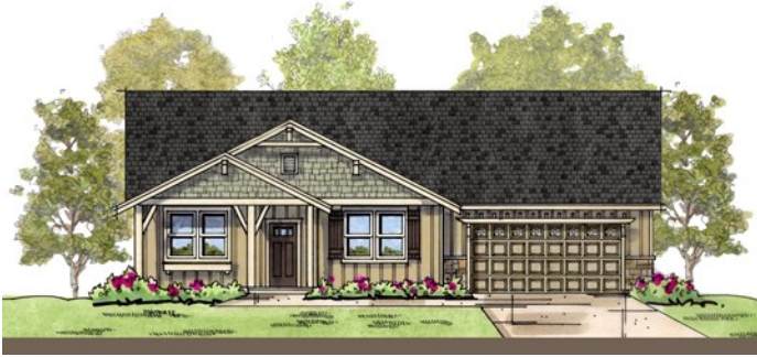
Alpine 1 (included)

2,118 sqft • 3 beds, 2 baths • flex room • 2-car garage