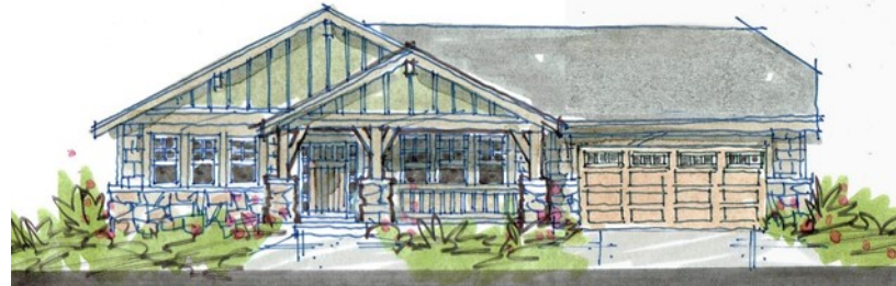
Alpine 2 (optional)