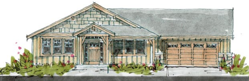
Alpine 1 (included)

2,260 sqft • 3 beds, 2 baths • den/office option • 3 car garage